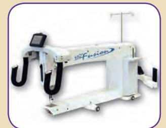
HQ 24 FUSION®