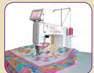
HQ SWEET SIXTEEN® Sit-down