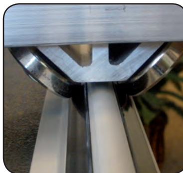
PRECISION-GLIDE ALUMINUM TRACK SYSTEM AVAILABLE

SEE YOUR TRAINED HQ REPRESENTATIVE FOR DETAILS.