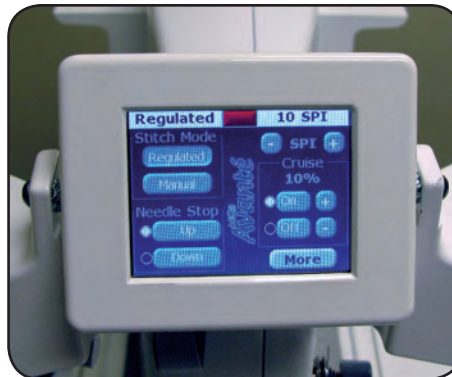
COLOR TOUCH-SCREEN ON FRONT AND BACK HANDLEBARS